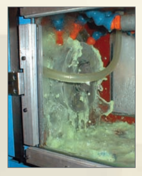
For over 10 years Setco™ has tested all major seals under varying harsh operating environments and determined that the Setco AirShield™ is the best spindle seal system in the industry.