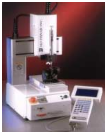
Figure 1 – FIP gasket application on a small, semi-automatic robot

With a decade of installed units to reference, this category of machines have shown remarkable reliability. Maintenance is relatively simple, and they are built robustly and fit for shop floor use. They may incorporate self diagnostic procedures in case of malfunctions.